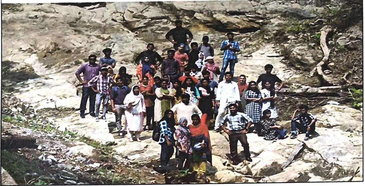
FIELD VISIT TO LANDSLIDE PRONE AREA IN KANNAPAMCHOLA-27/11/2018