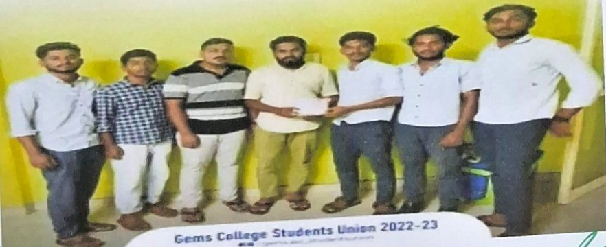
Gems College Students Union 2022-23

സഹകരിച്ച സഹായിച്ച മുഴുവൻ അളവുകൾക്കും ഘൃദയം നിറഞ്ഞ നന്ദി